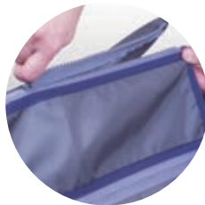
XXL Size Extension